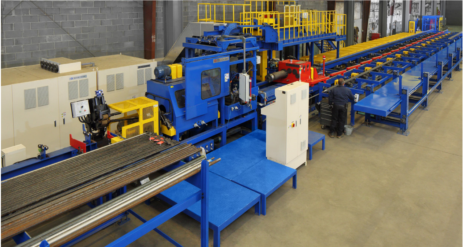
Boiler Tube Company of America's Spiral Finning Machine