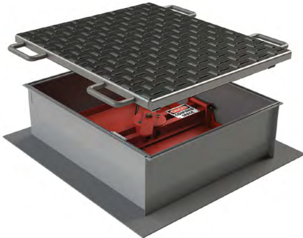
Imtec Roof Door System

The FLEXISEAL doors have one or more yokes with closing screws that act on center point(s) of the door. This flexes the door plate toward the interior and assures a tight seal with the gasket. When opening the door, special safety features in the latch and screw mechanism(s) will assure that the latch pin cannot be removed easily until the door plate with its gasket is safely retracted from the sealing surface on the frame plate, thereby revealing any dangerous internal pressure and also preventing damage to the gasket.