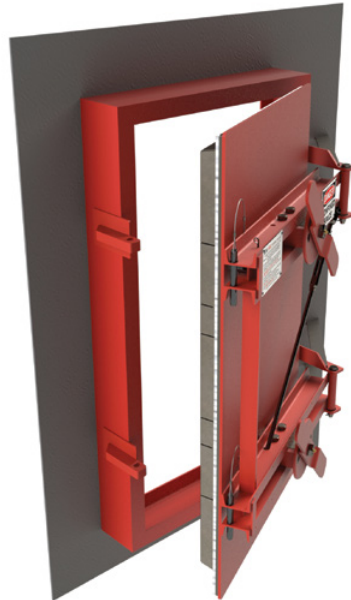
Imtec Boiler Door with Tube Panel

The FLEXISEAL doors have one or more yokes with closing screws that act on center point(s) of the door. This flexes the door plate toward the interior and assures a tight seal with the gasket. When opening the door, special safety features in the latch and screw mechanism(s) will assure that the latch pin cannot be removed easily until the door plate with its gasket is safely retracted from the sealing surface on the frame plate, thereby revealing any dangerous internal pressure and also preventing damage to the gasket.